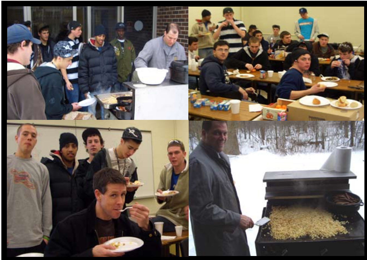
The Trades classes and teachers take time out to share a Christmas breakfast at Mohawk.