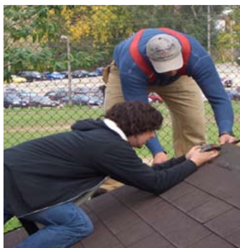
Students get a taste of roofing as part of their Trades Pre-Apprenticeship.