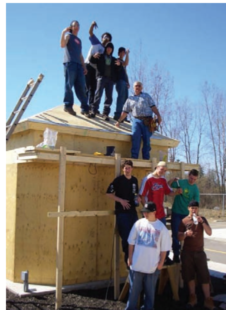
There is a significant commitment by students who are successful.